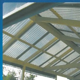
Standard Grey – Before

SolaFrost reduces the expansion noise associated with standard polycarbonate sheeting