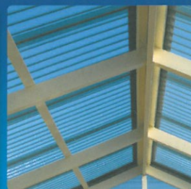
SolaFrost Grey – After